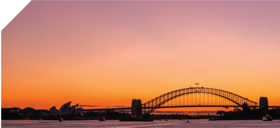
Harbour Bridge, Sydney